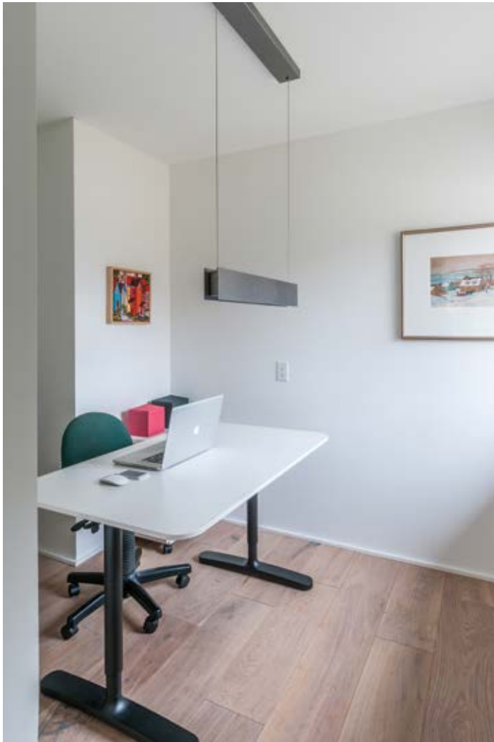
RIGHT AND BELOW CENTRE: A pair of simple but efficient his-and-hers offices flank the main living space. BELOW LEFT: The grandfather clock keeps time by the main entrance. BELOW RIGHT: A narrow powder room with gold-framed mirror services guests on the main floor.

The kitchen is separated from the living and dining room by a dual-level counter in leathered granite. The reverse side is composed of open shelves finished with white lacquer and used for displaying artefacts and books in the dining room. In the kitchen, more open shelves in the same finish are featured for glassware and other attractive pieces. The cabinets were built by Dylan Barlow of Barlow Cabinetworks and the countertop is from Di Pietra Design . Plumbing here and in the bathrooms was installed by Andy Mueller of Mueller Plumbing Contractors and the fixtures are Aquabross from Marks Supply Inc. Hardware everywhere was supplied by Upper Canada Specialty Hardware. The LED dining chandelier and office fixtures were designed by Patrick Stark Design, as was the 12-foot kitchen light and hanging, LED disc lights throughout the home. The audio system was installed by ARDCO. Continued on page 54