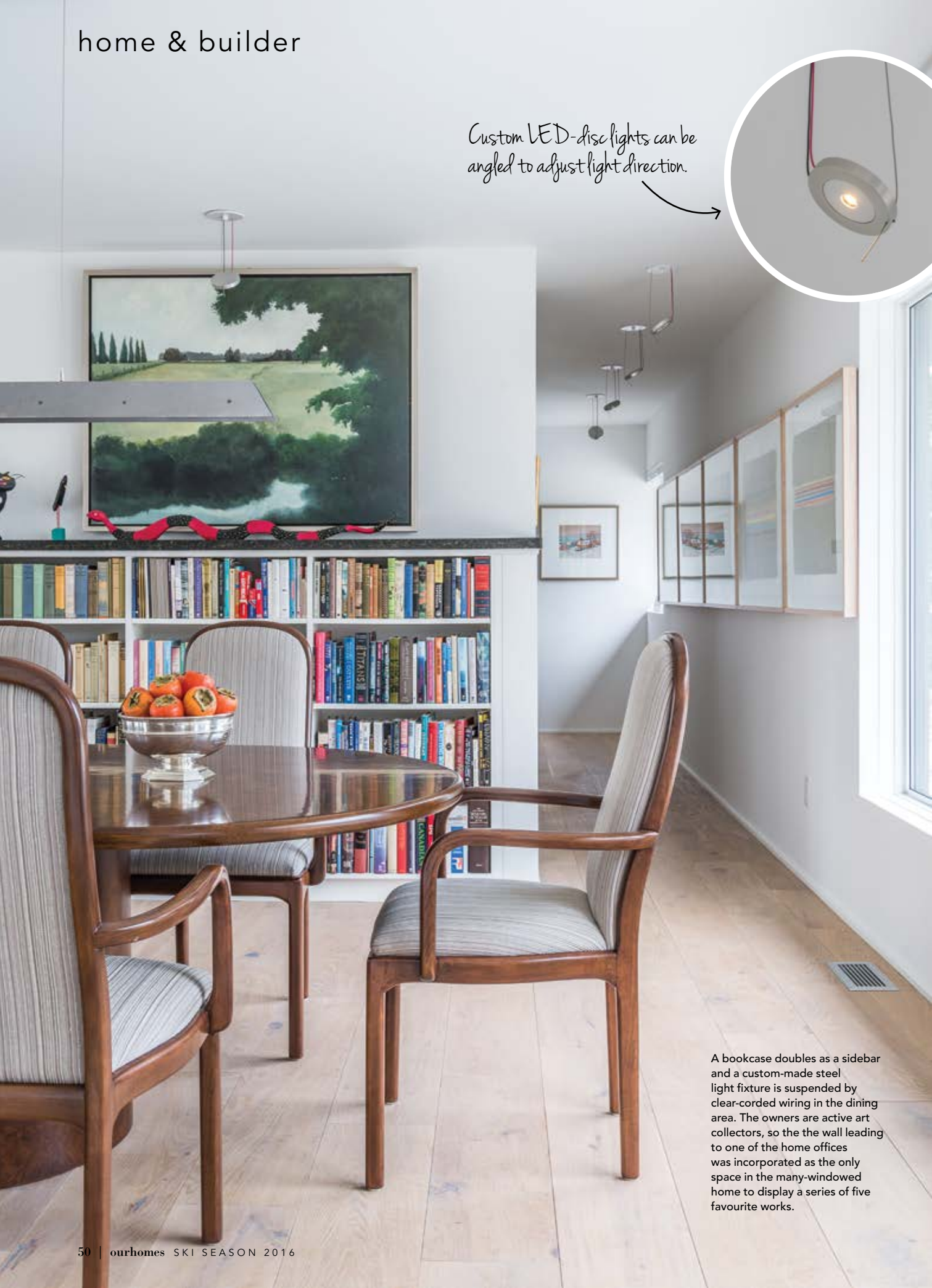
Custom LED-disc lights can be angled to adjust light direction.