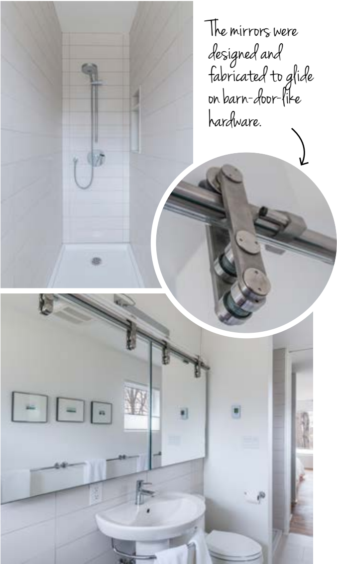
The mirrors were designed and fabricated to glide on barn-door-like hardware.