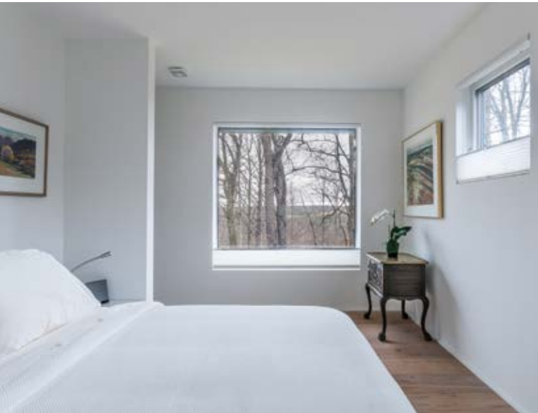
The lower level houses a guest suite, exercise space and storage as well as the workings of the house. The mechanicals include a top line HVAC system, on-demand water heater, air-to-air heat pump and a forced-air, propane-fired back-up, all installed by Nottawasaga Mechanical . The electrical system by Bear Electric has enough capacity to charge additional electric cars. The Generator Guys provided the Generac back-up system. In this minimalist design, Village Builders demonstrate what modern and efficient amenities are capable of: a low-maintenance, attractive home with a feeling of comfort and welcome. OH