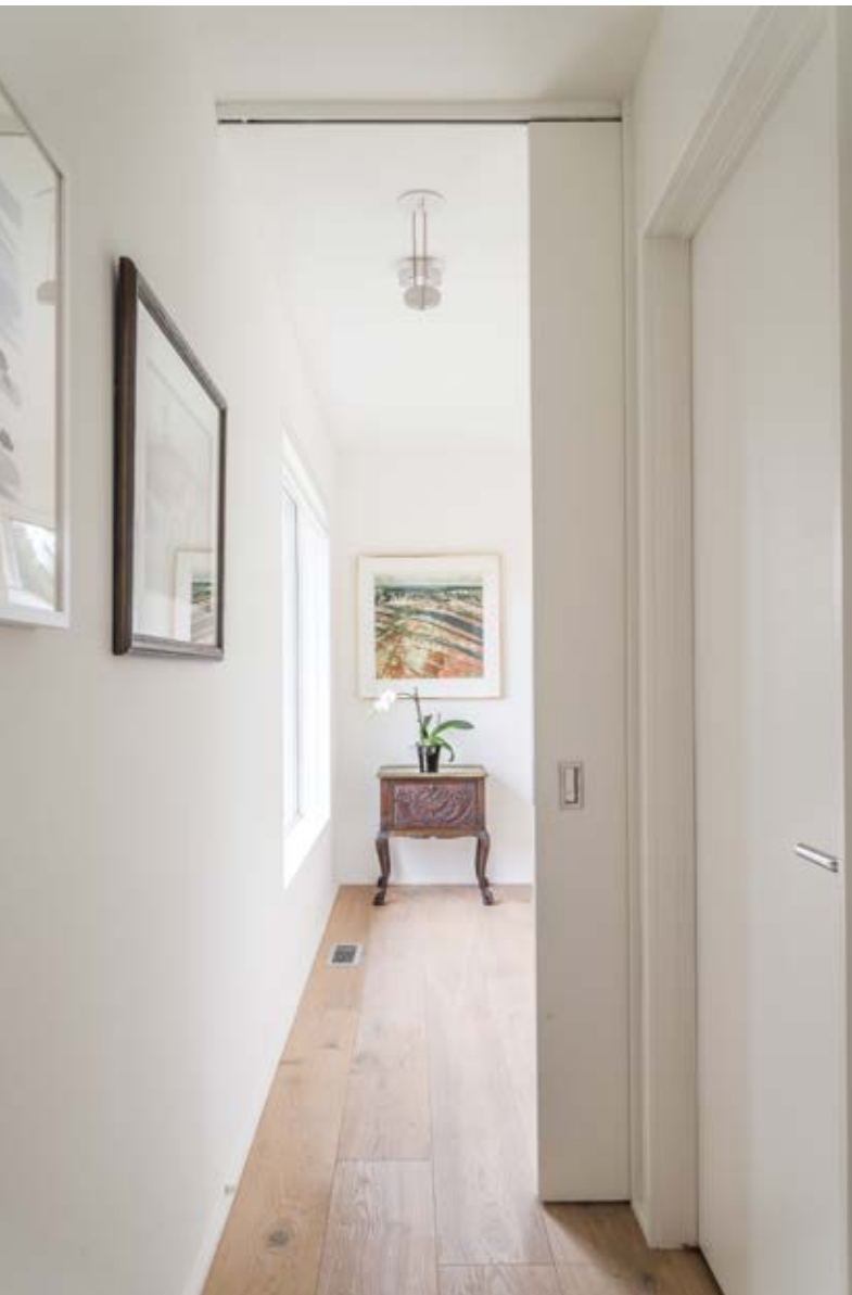
LEFT AND BOTTOM LEFT: The master suite is separated from the main room by a simple floor-to-ceiling pocket door. BELOW: The en suite is practical, including a spacious walk-in shower and a large tub that sits under the window.