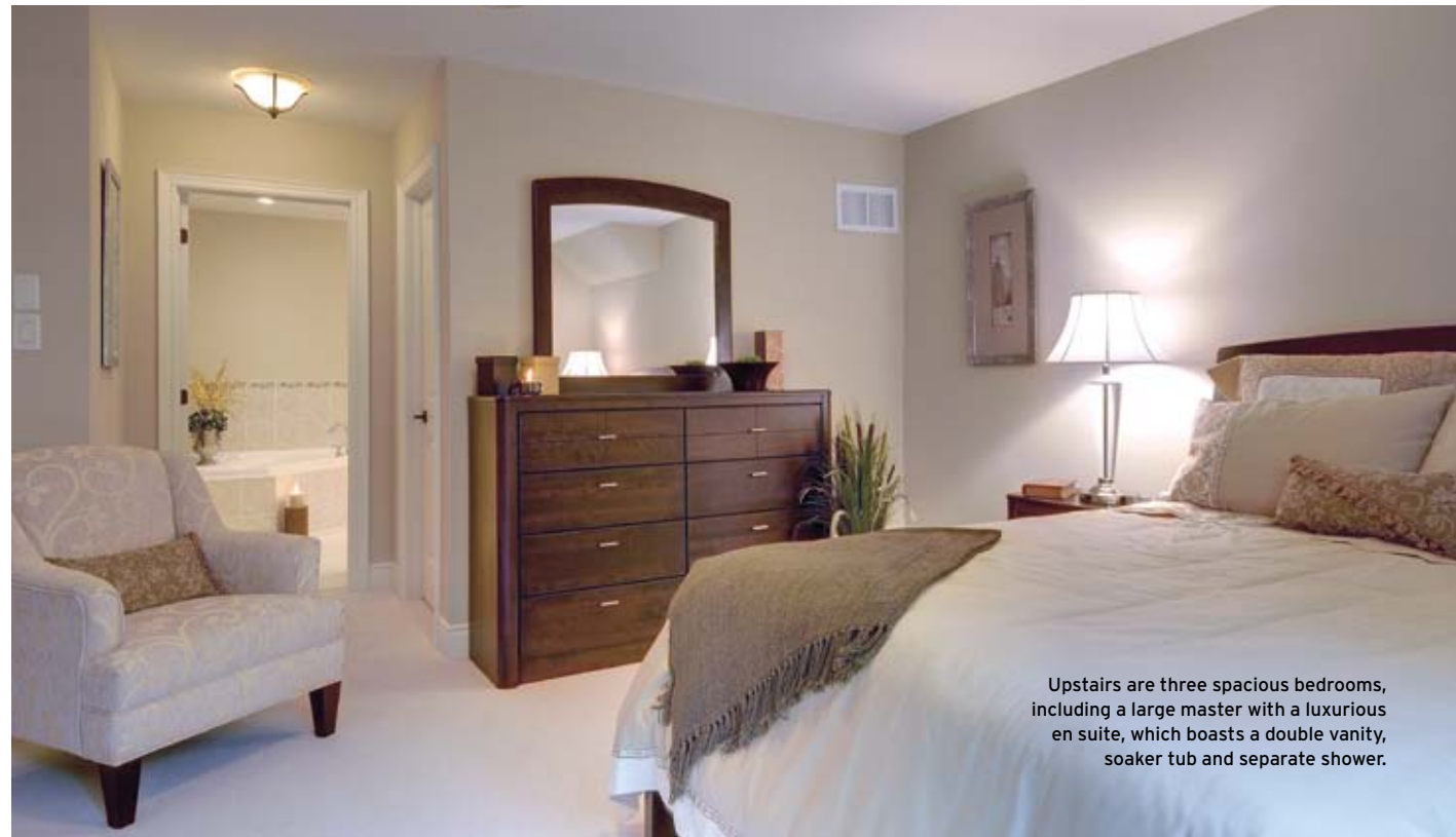
Upstairs are three spacious bedrooms, including a large master with a luxurious en suite, which boasts a double vanity, soaker tub and separate shower.

Some of the highlights of the open-concept model include: upgraded kitchen cabinetry, an island with double stainless sink and built-in dishwasher, premier grade strip hardwood flooring, nine-foot main-floor ceilings, convenient ground-floor laundry room, oversized custom casings and baseboards, oil-rubbed hardware fittings throughout and ceramic tub and shower enclosures.