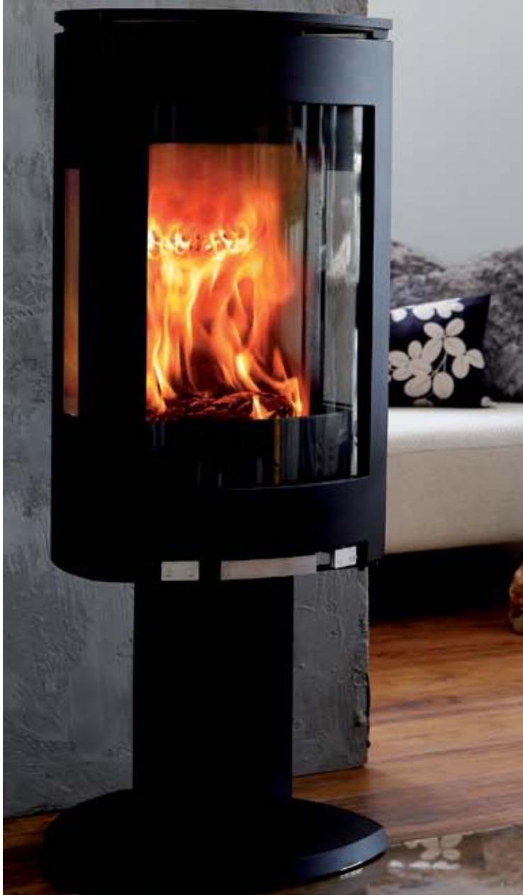
The Jotul F370/GF370 in Wood or Gas

Hearth & Leisure 6 Elora St. South, Clifford 1.519.327.9663 www.hearthandleisure.com