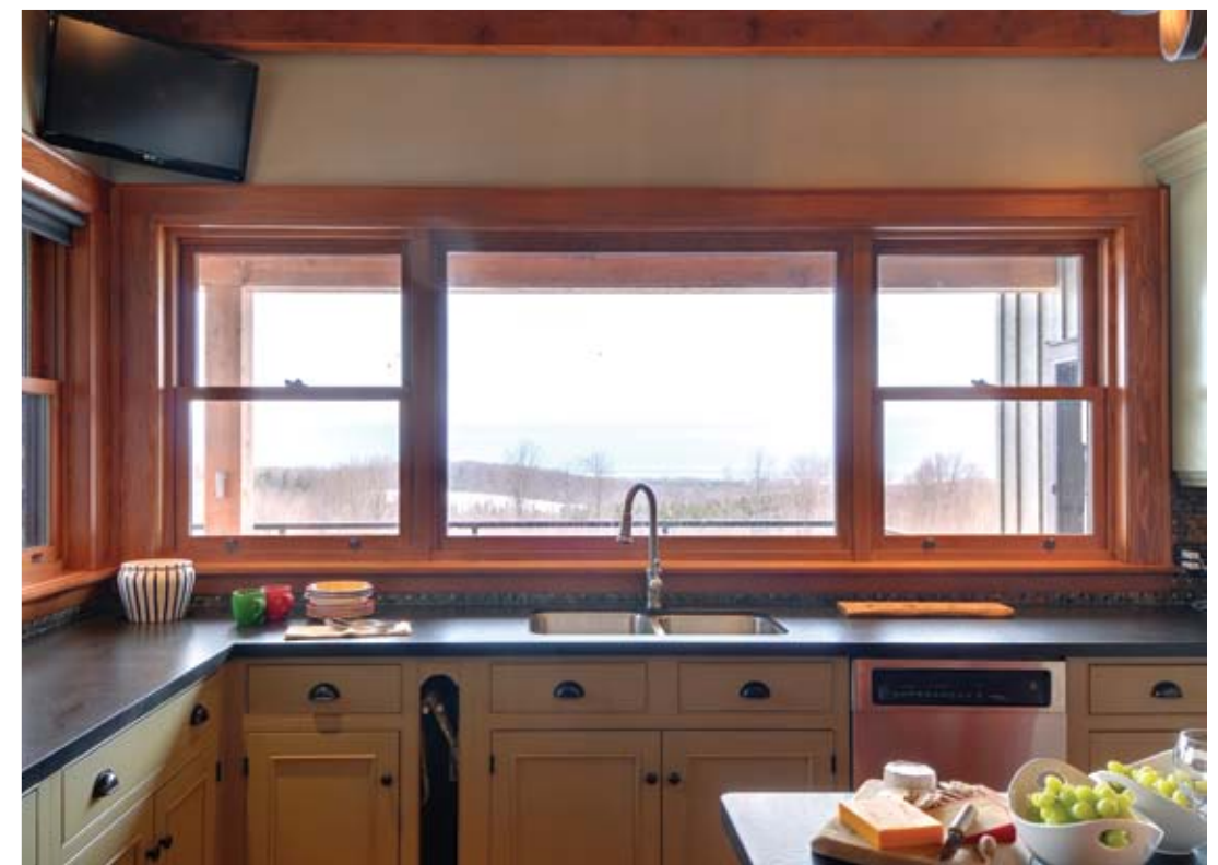
TOP RIGHT: An immense black iron chandelier, custom designed by Pete Muller of Pete's Metal Works in Nottawa, hangs above the dining room table. RIGHT: The kitchen window offers a glorious view of the valley.