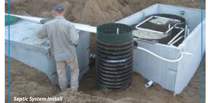
Septic System Install