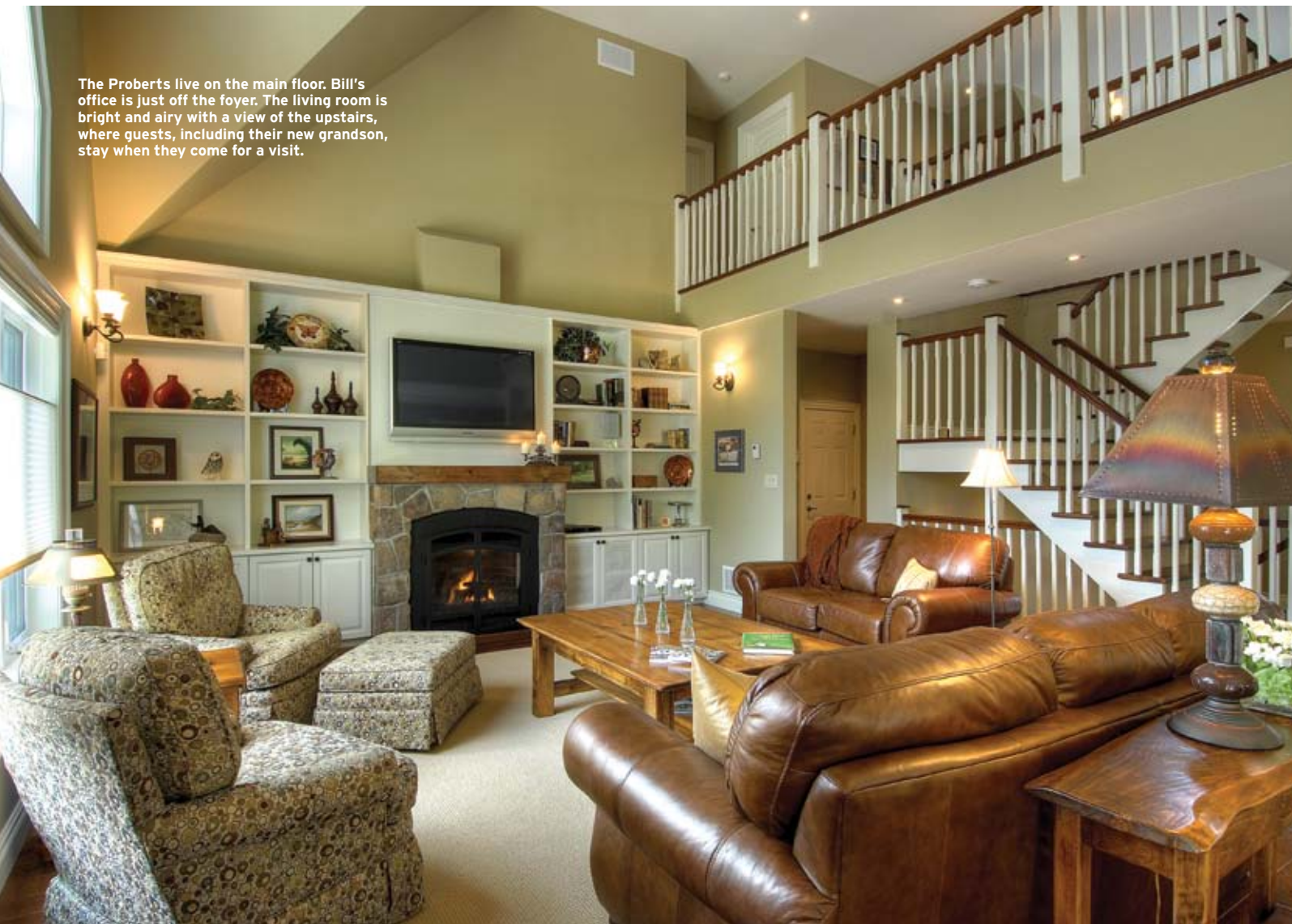
The Proberts live on the main floor. Bill's office is just off the foyer. The living room is bright and airy with a view of the upstairs, where guests, including their new grandson, stay when they come for a visit.