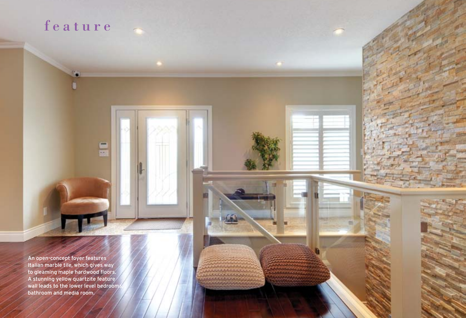
An open-concept foyer features Italian marble tile, which gives way to gleaming maple hardwood floors. A stunning yellow quartzite feature wall leads to the lower level bedrooms, bathroom and media room.