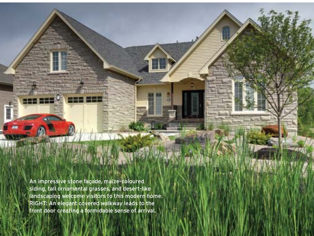
An impressive stone façade, maize-coloured siding, tall ornamental grasses, and desert-like landscaping welcome visitors to this modern home. RIGHT: An elegant covered walkway leads to the front door creating a formidable sense of arrival.