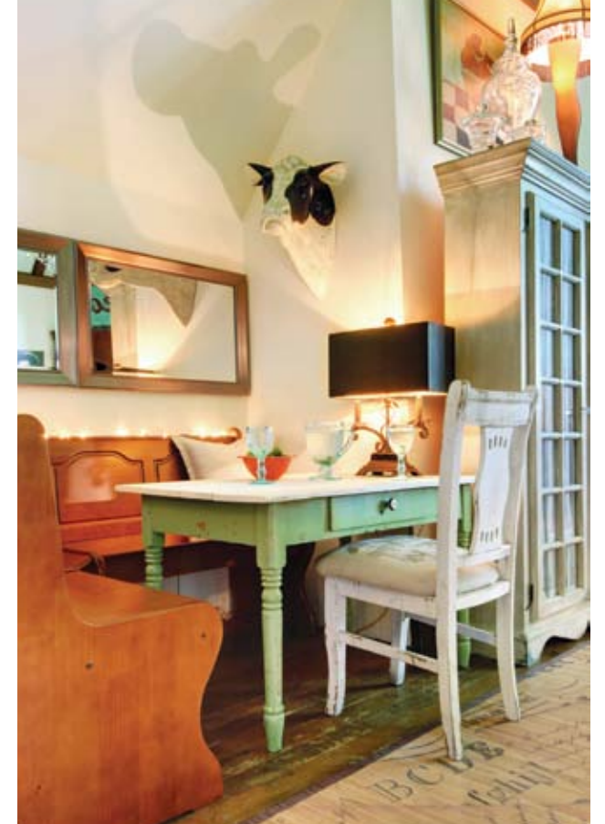
RIGHT: This intimate dining area features benches from the Meaford Factory Outlet. Check out the classic “fragile” lamp from A Christmas Story that Rhonda ordered online. BELOW: Come and sit awhile. Comfort beckons in the tranquil Zen-like atmosphere of this renovated church. Flower arrangements are compliments of Paperwhite Flowers. BOTTOM RIGHT: Cheers! Rhonda and Doug just celebrated their 30-year wedding anniversary. On the woodstove is Rhonda's collection of blue Depression-era glass.

The plaster on the inside of the exterior walls is original, as are the ceiling and front vestibule door, complete with original skeleton key. The hemlock floors, likely logged and milled locally out of a nearby grove, were taken up to reinforce the floor joists, but the hardwood was all carefully re-laid and restored to a deep brown lustre. Outside, the roof was replaced with steel in the early 2000s by Hy-Grade Steel Roofing Sytems in Guelph. Continued on page 100