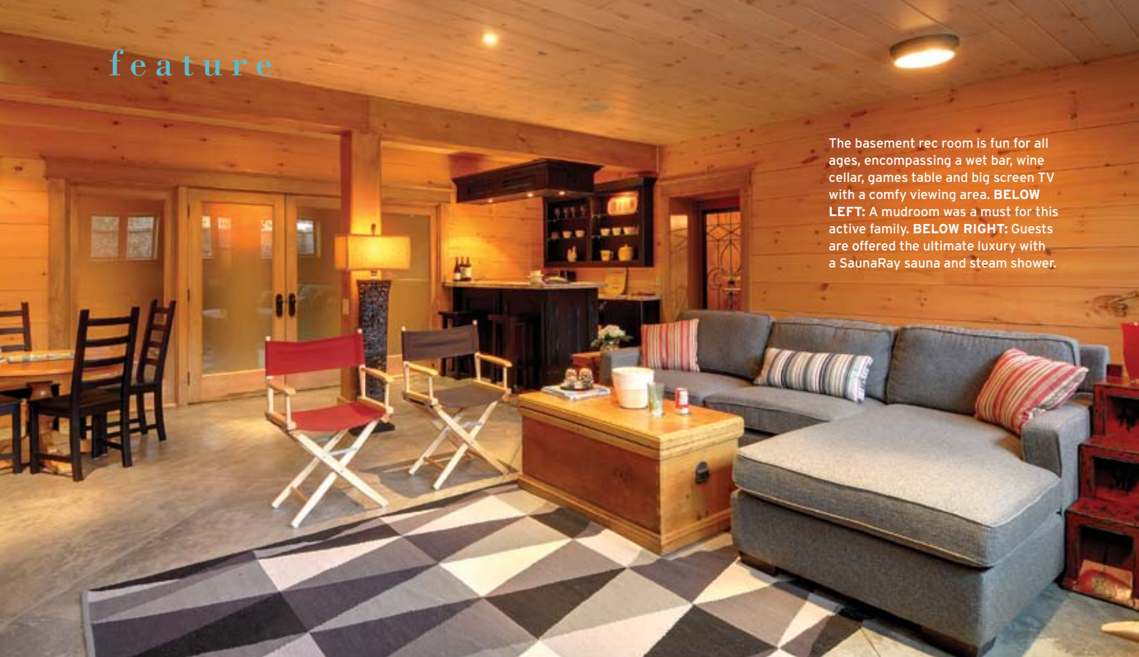
The basement rec room is fun for all ages, encompassing a wet bar, wine cellar, games table and big screen TV with a comfy viewing area. BELOW LEFT: A mudroom was a must for this active family. BELOW RIGHT: Guests are offered the ultimate luxury with a SaunaRay sauna and steam shower.