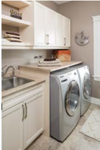
FAR LEFT: With big windows and bright, fun paint, it's hard to believe this bedroom is in the basement. LEFT: The functional main-floor laundry space is lighter than most other rooms but still fits the cottage-like scheme.