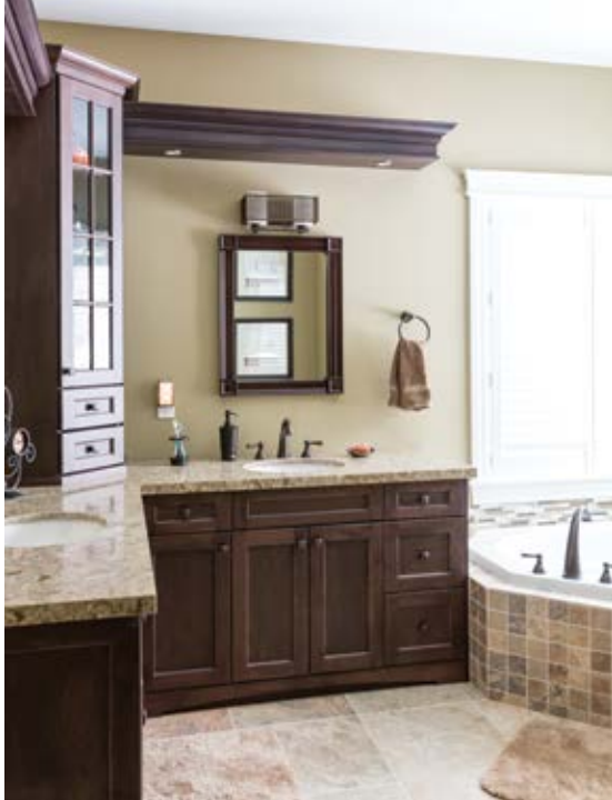
LEFT: Hanley carried the same rustic colour scheme into the main-floor master. ABOVE: The master en suite includes similar cabinetry and woodwork as other living spaces in the home.

Engineered antique five-inch Maple Del Rio flooring from Sarmazian Bros. Ltd. (who also supplied the home's carpeting) and installed by Manor House Flooring Inc. completes the cabin-like look in a modern way.