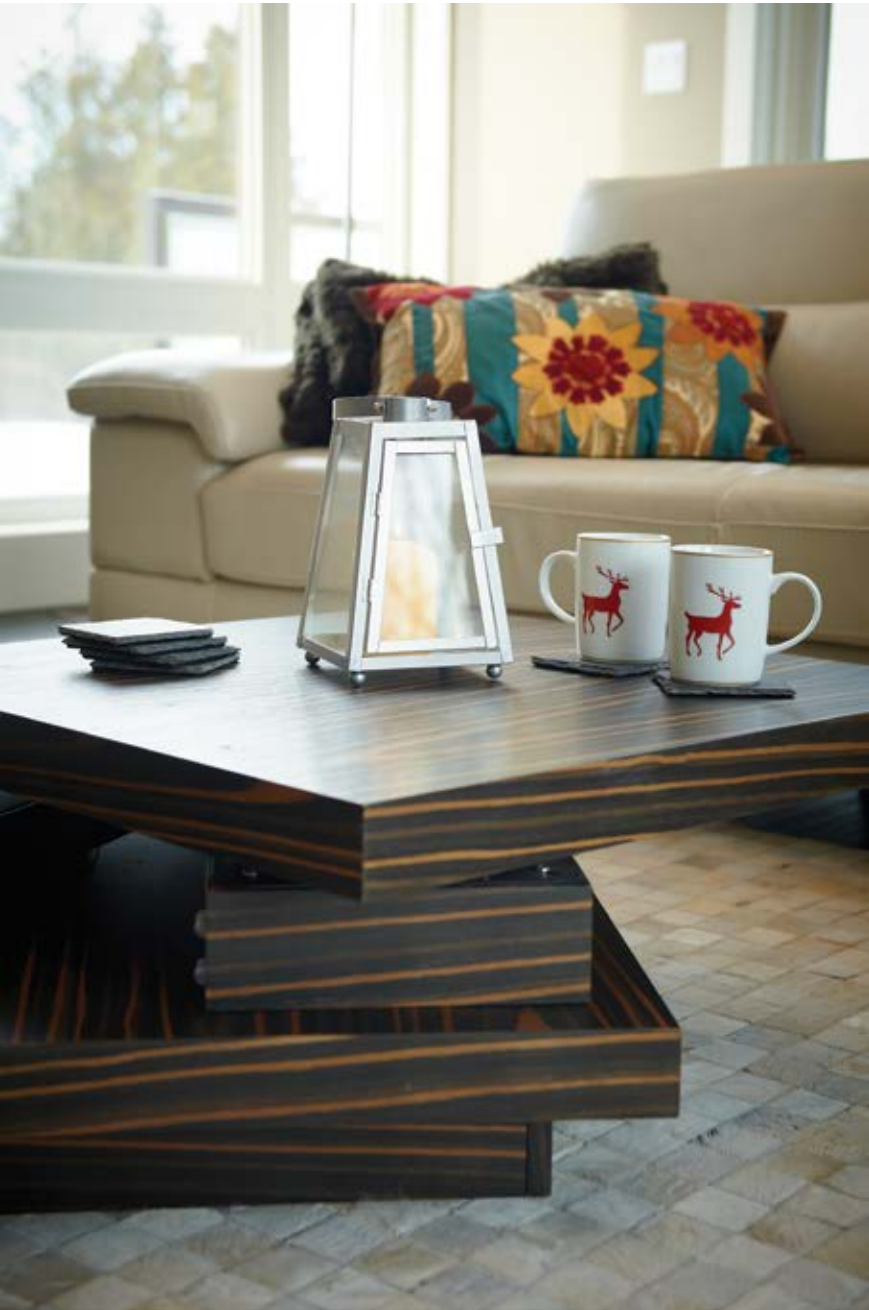
ABOVE: A unique table acts as a centerpiece to the great room. RIGHT: The back of the home boasts a picturesque entertaining area and a steaming hot tub.