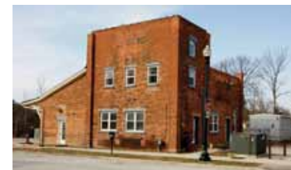
DOWNTOWN OAKVILLE BUILDING

$950,000 Magnificent 1830sf 2 bdrm + den condo. Panoramic views of Lake Ontario from every room & sunset views over the escarpment. Eat-in kitchen w/granite, large 18'x 10' terrace. 2 U/G parking spots & lrg storage locker.