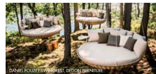
DANIEL POUZET SWINGREST, DEDON FURNITURE

PORCH SWING: You can't go wrong with Dedon. If I could break into someone else's bank account, then their new Swingrest may be my first purchase. For a more budget-friendly approach, consider a simple, classic wood swing hanging from chains on your outdoor porch. You know what makes this design decision work best? A hot day and some lemonade!