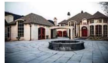
PREMIER LAKEFRONT RESIDENCE

To Get More Info & Photos On These Listings, Text the Code to 86377