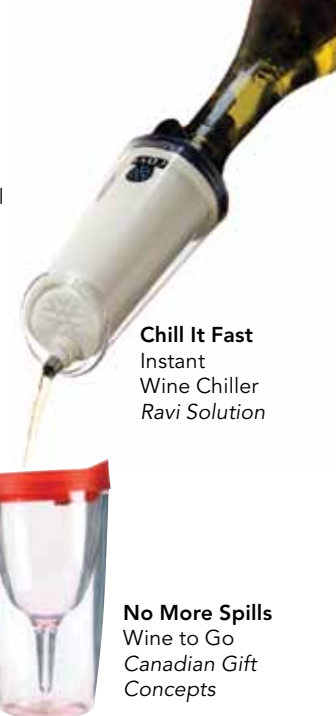
Chill It Fast Instant Wine Chiller Ravi Solution