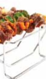
Grill It Multi Function V-Rack Broil King