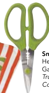
Snip & Cook Herb and Garden Snips Trudeau Corporation