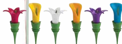
Seal It Tight Duo Tone Wine Bottle Stoppers Trudeau Corporation