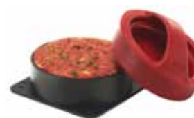
Grill Gourmet Burgers Grill Pro Stuffed Burger Press Broil King