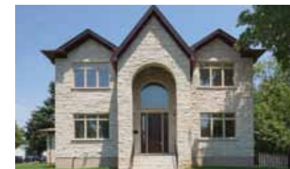
OAKVILLE CUSTOM BUILD

$7,000,000 Stunning 12,000sf of luxury finishes. 4+1 bdrms w/ main flr mstr retreat. Slab limestone floors, 2 kitchens, 8 fp's, theatre, 6 tv's, home automation, w/o bsmt, dble infinity pool w/hot tub, 3+2 car grg, Riparian Rights.