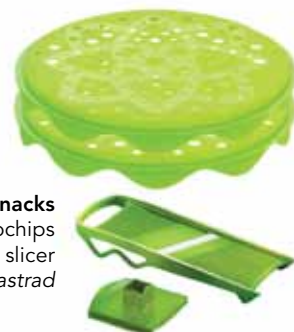
Healthy Snacks Topchips Maker & slicer Mastrad