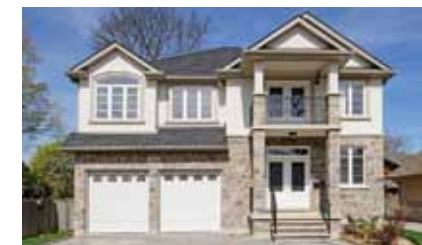
ESCARPMENT CUSTOM BUILD

$900,000 Own a part of downtown Oakville's history! This one-time radial train station could be converted to commercial office space, interesting retail space or even bar/restaurant opportunity.