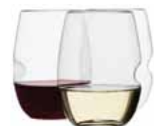
SHATTERPROOF GLASSES, GOVINO