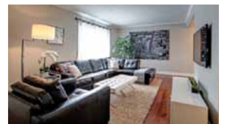
SOUTH BURLINGTON TOWNHOME

$292,000 Updated 2 bdrm 1.5 bath in the Brownstones! Newer carpet in rec rm/poss 3rd bdrm, hardwood-look flrs on 2nd & 3rd levels, S/S appls, wood frpl, new cabinetry in kit, newer furnace, windows & doors.