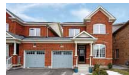
SPACIOUS 3BDRM SEMI

$649,000 Immac 4 bdrm, 4 bath, lovingly maintained by orig owners. Hrdwd in DR & FR, master w/ensuite. Kit, laundry rm & bsmt w/o's, new furn/air. Gorgeous saltwater pool & landscape backing onto greenspace.