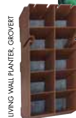
LIVING WALL PLANTER, GROVERT