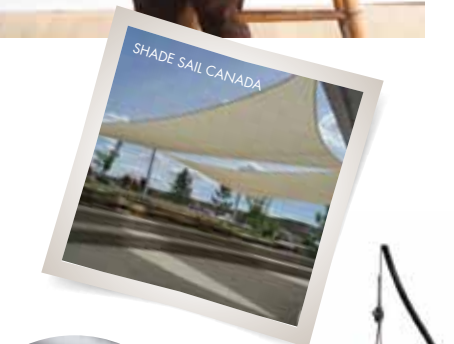
SHADE SAIL CANADA

FAKE GRASS: The new faux grass is truly impressive. With an under-layer of what appears to be dried grass, you would be hard pressed to tell the difference. It no longer looks like Astroturf. And the best part? No dandelions. If you have an area that doesn't get a lot of light or you're short on time to care for your lawn, then try it! You won't be disappointed. (...and you don't have to tell!) OH