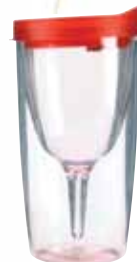
No More Spills Wine to Go Canadian Gift Concepts