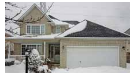
HEADON FOREST EXECUTIVE

$650,000 Gorgeous 4 bdrm, 3 bath home w/escarpment & bay views! Nestled amongst million dollar homes, open concept, granite in kitchen & baths, S/S appls, balcony, crown moulding, dble garage.