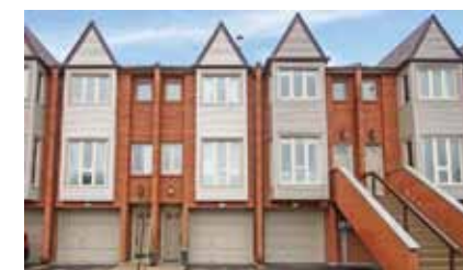
GORGEOUS S.BURL TOWNHOME

$450,000 Spacious semi-det 3 bdrm home on large lot. Open concept layout, upgraded kitchen w/granite, S/S appliances, pot lights. Large fam rm w/gas frpl. Master has ensuite. Close to schools, hwy's & shops.