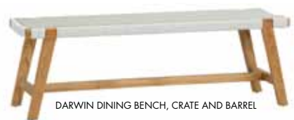
DARWIN DINING BENCH, CRATE AND BARREL