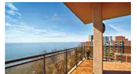
LUXURIOUS LAKESIDE LIVING

$1,265,000 Gorgeous 4+2 bdrm, 5 bath home. Kitchen has huge island w/sink, 6 S/S built-in appls, granite countertops, stone flrs. Bdrm level laundry, hrdwd thruout, marble, granite & glass in bathrms.