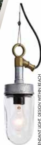
PENDANT LIGHT, DESIGN WITHIN REACH