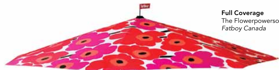
Full Coverage The Flowerpowersol Fatboy Canada