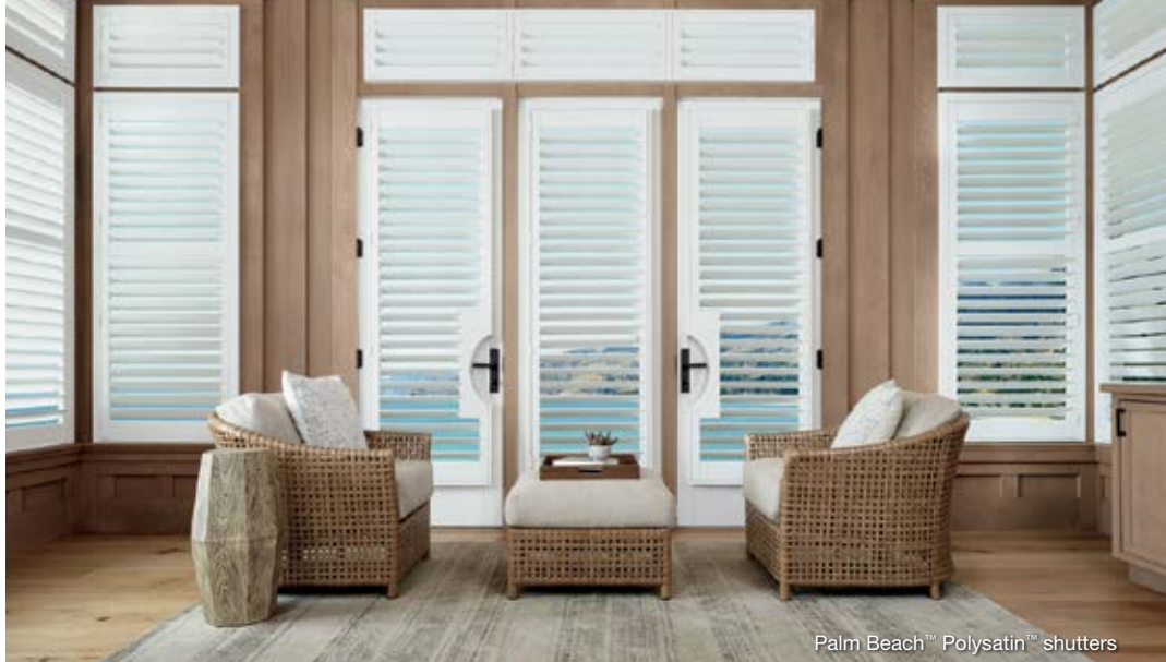
Palm Beach™ Polysatin™ shutters

With Hunter Douglas, the possibilities are endless.