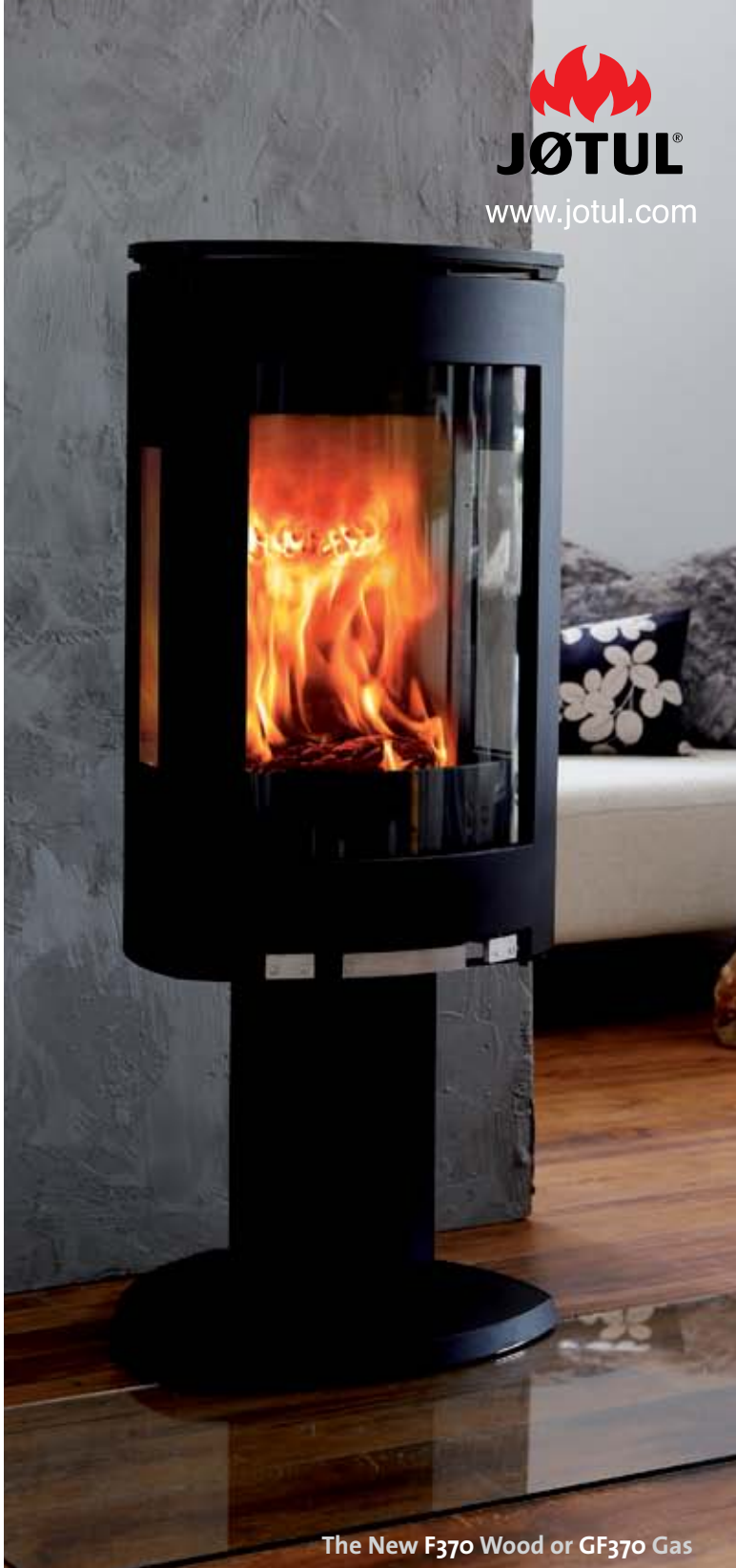
The New F370 Wood or GF370 Gas

Authorized Woodstove & Repair, Marmora 613-472-1057 pelletpower@live.ca