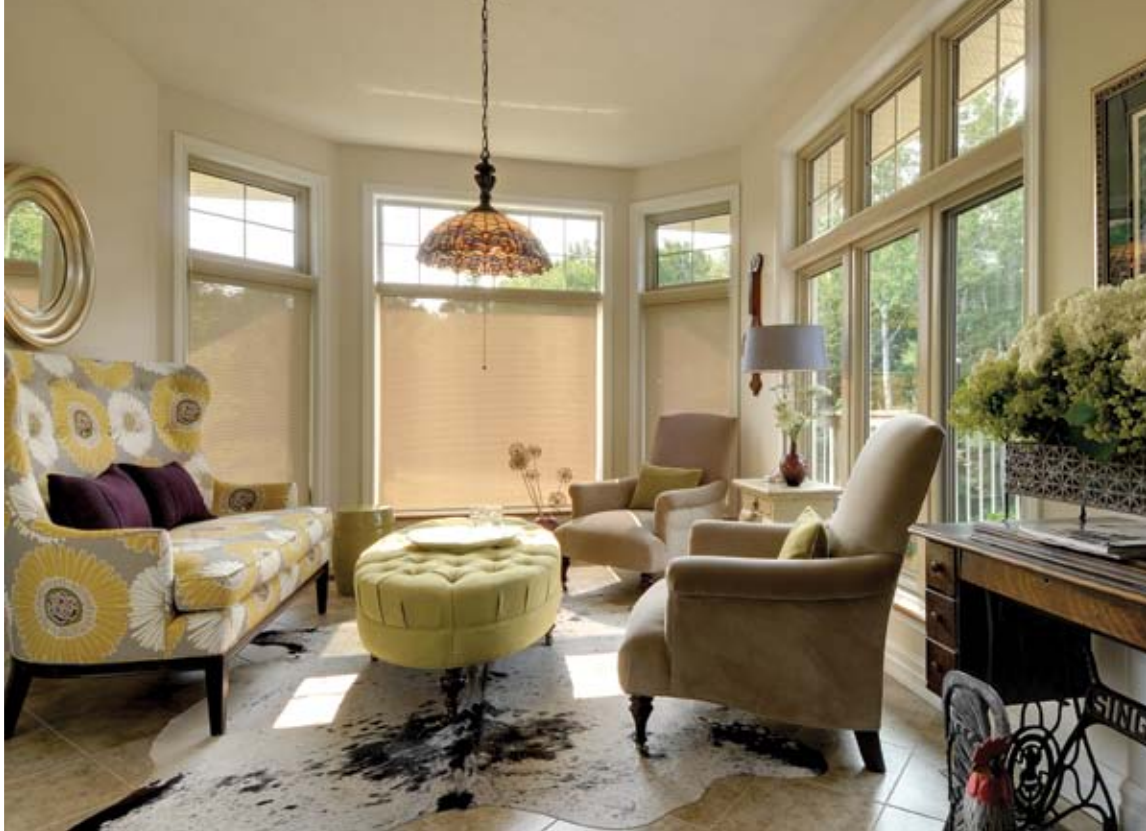
RIGHT: The sunroom, located off the kitchen and dining areas, is Linda's favourite space. BOTTOM LEFT: The open concept kitchen is a busy family centre. Every cupboard is designed for specific storage use. BOTTOM RIGHT: An open steel staircase with solid maple treads rises to the third-floor master bedroom.

The Pitres also wanted a finished basement with radiant heat floors there and in the mudroom, four bedrooms, three bathrooms, a central great room with wood-panelled cathedral ceiling and an elegant master bedroom loft with en suite. The exterior second-floor decks have gorgeous views. Throughout are energy-efficient Ostaco 4000-series windows and doors. "I use these windows and doors in the homes I build (for clients) because they have more profile and style and this is a high-end window that meets everybody's budget," Brad says.