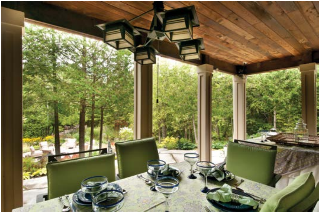
LEFT: The 6,000 sq. ft. home was a shell when the homeowners purchased it. ABOVE TOP: Limestone walkways lead to a variety of relaxation areas and reflective spaces. ABOVE: Out back, the covered porch is an ideal spot to dine at day’s end.