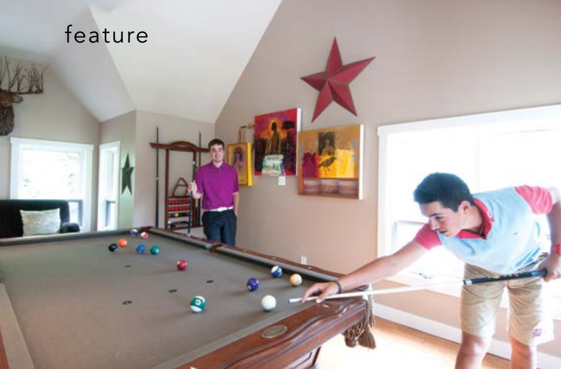
LEFT: A second-floor games and media room is where the kids and grandkids unwind. BELOW: A skylight brightens up this bathroom, which leads to another outdoor seating area on the balcony offering a bird's eye view of the property. BOTTOM: Every weekend, the family drives from Sudbury to their private and peaceful oasis nestled in the country.