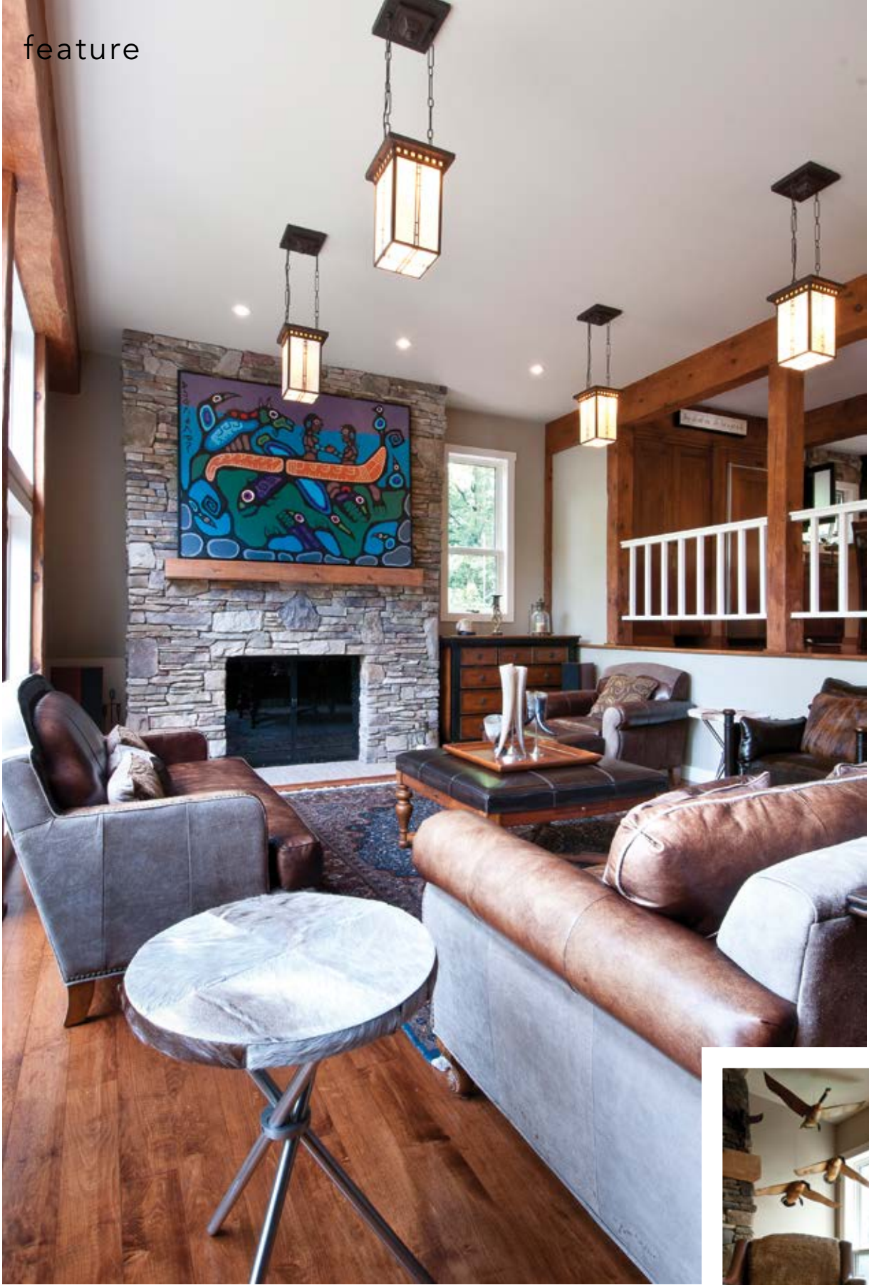
ABOVE: The sunken great room features colourful native art, generous windows, pony tables and plenty of wood, stone and leather accents. RIGHT: Folk art is tastefully displayed throughout the home, including this fanciful wooden “Simpsons” chess set.